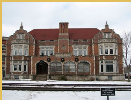
Our venue: The Welfare Building